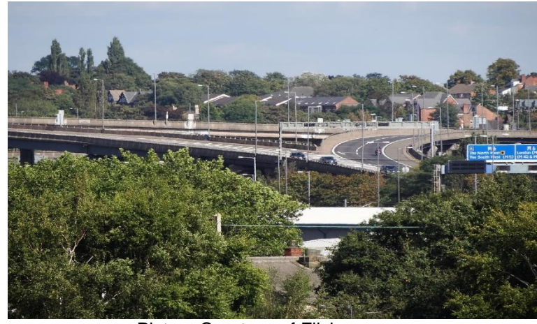
Gravelly Hill Interchange-Early Years Spaghetti Junction Story (1972)