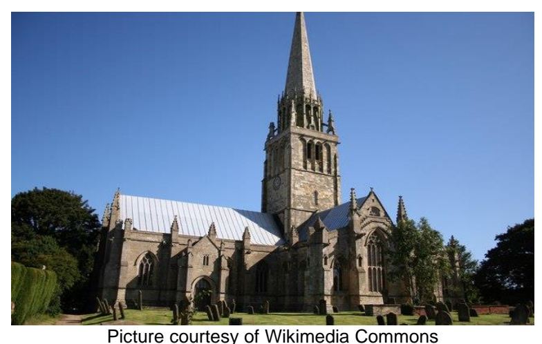
Patrington Church Patrington Village, Yorkshire (1955) (Shell Films) (Discovering Britain Series) 3 Mins B/W

A visit to East Yorkshire to take a close look at Patrington Church. Initially sweeping us the viewers, in from the East Coast to the quaint village of Patrington and the focus of the film, the church. The short film is complemented by John Betjeman's expert narration. Informing us of the beautiful architectural features of Patrington's fine church.