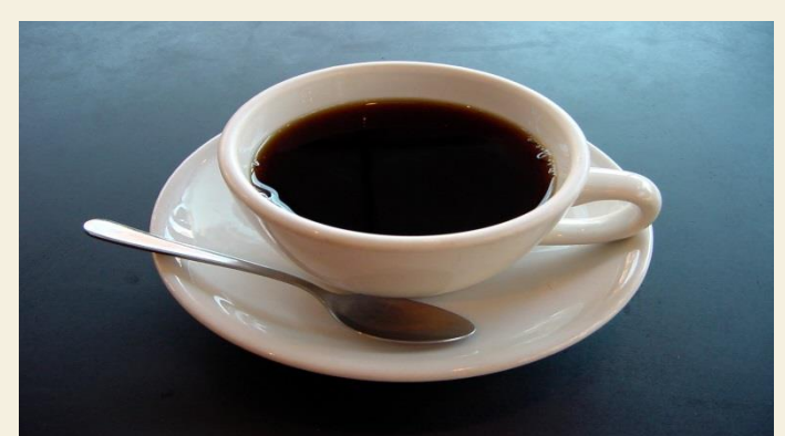
Time for a Coffee! Image courtesy of Wikimedia Common Good Strong Coffee (1968) (Advert) 2 Mins Col

Hazy summer scene with the Cadbury's Flake girl enjoying a moment of chocolate indulgence!