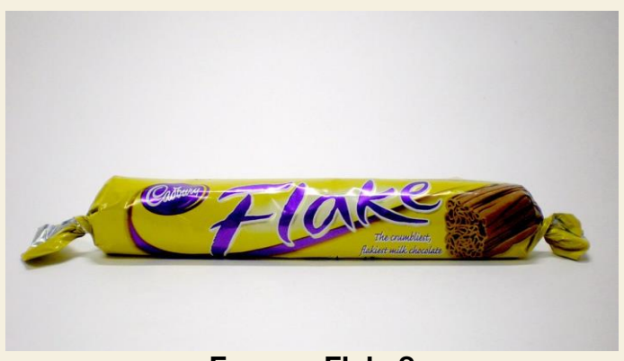
Fancy a Flake?

Cadbury's Flake: Sunflowers (1982) (Advert) 1 Min Col