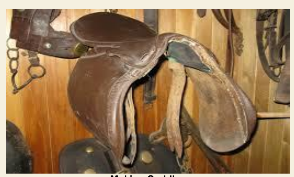
Making Saddles Saddle Making (1965) (ATV) 5 Mins B/W