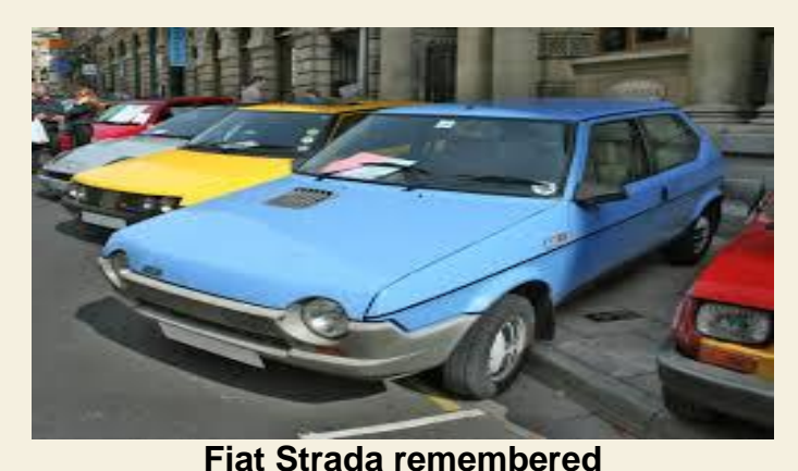
Flat Strada remembered

Promoting the telephone; Buzby the little yellow bird narrated by Bernard Cribbins; teatures Buzby's mother whom sounds like Irene Handl, catching up with some local gossip over the garden fence, in this late 1970's advert, with a reference to popular Television representations.