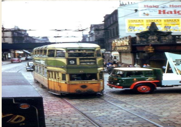
End of an era; Glasgow says goodbye to her Trams.