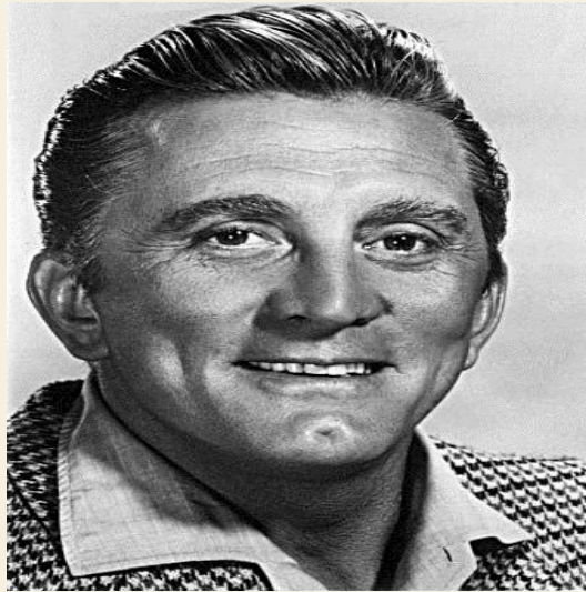
Kirk Douglas in Weymouth