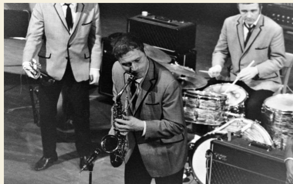
Mr Acker Bilk and his Paramount Jazz Band

Eden Kane sings his hit single "Forget Me Not". This short film is a Cinebox offering an obvious precursor of the pop video and were presented via video juke boxes.